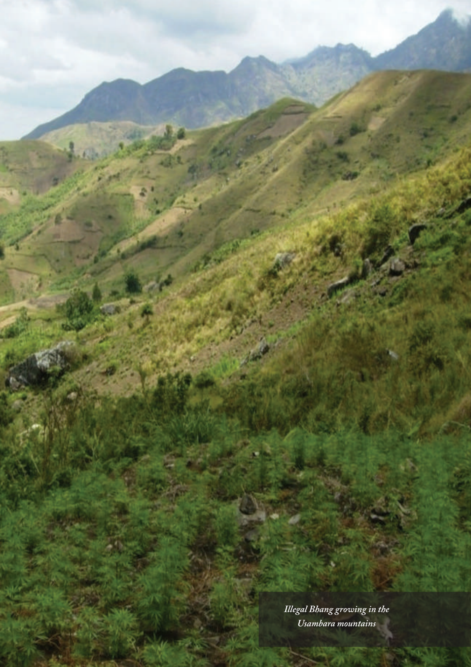
Illegal Bhang growing in the Usambara mountains