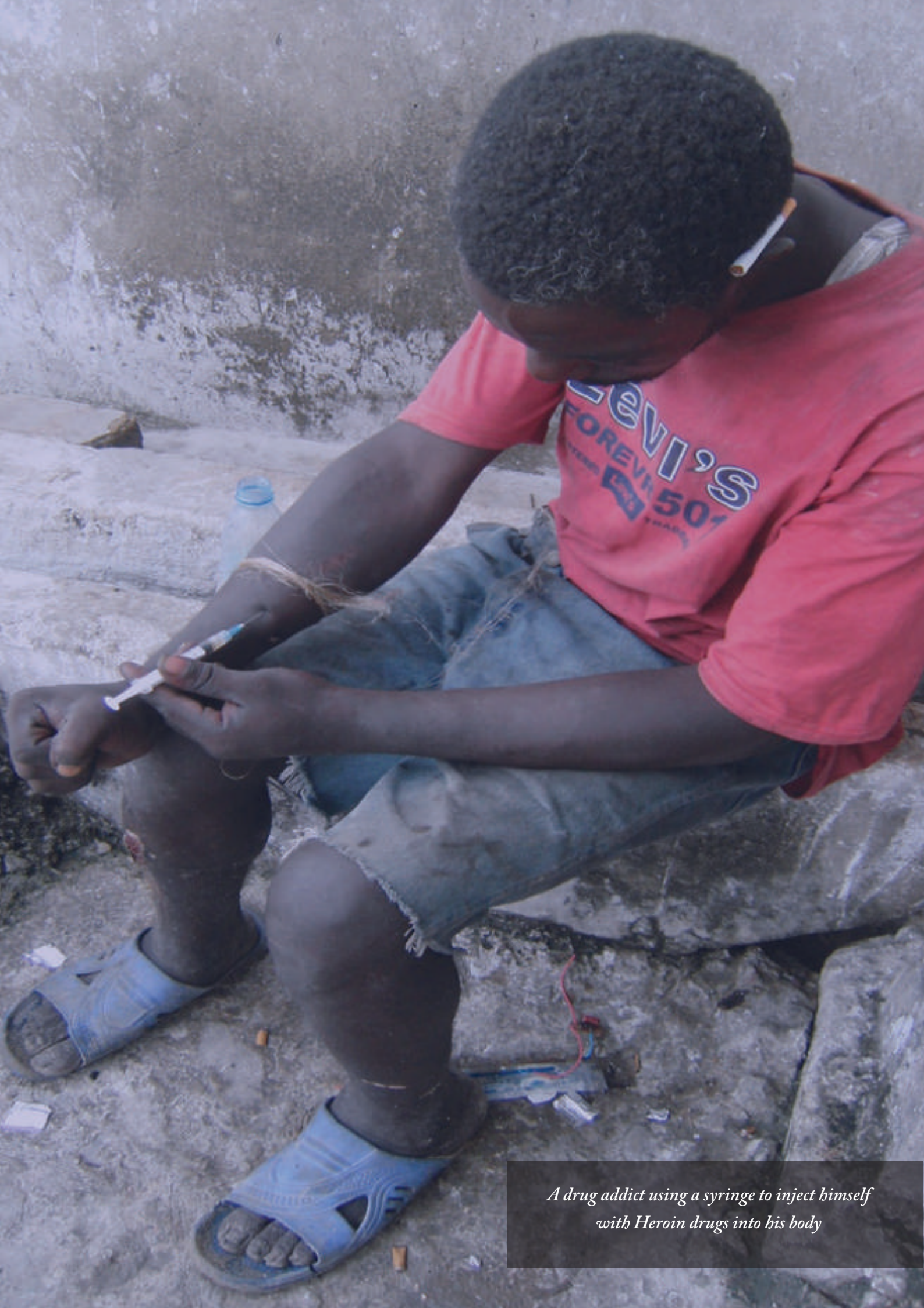
A drug addict using a syringe to inject himself with Heroin drugs into his body